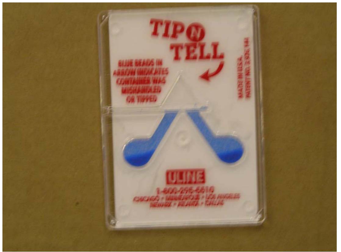
Tip & Tell Monitor on PFM BDA SN 14 box, All OK

SPIRE-RAL-REP-002379. PFM BDA SN 14 Incoming Inspection Report. Photo's