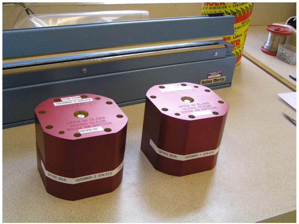
PFM BDA SN 13 & 14: In G56 Prep Area. Outside surfaces have been cleaned with IPA prior to taking into the Class 100 Clean Room for further inspection.