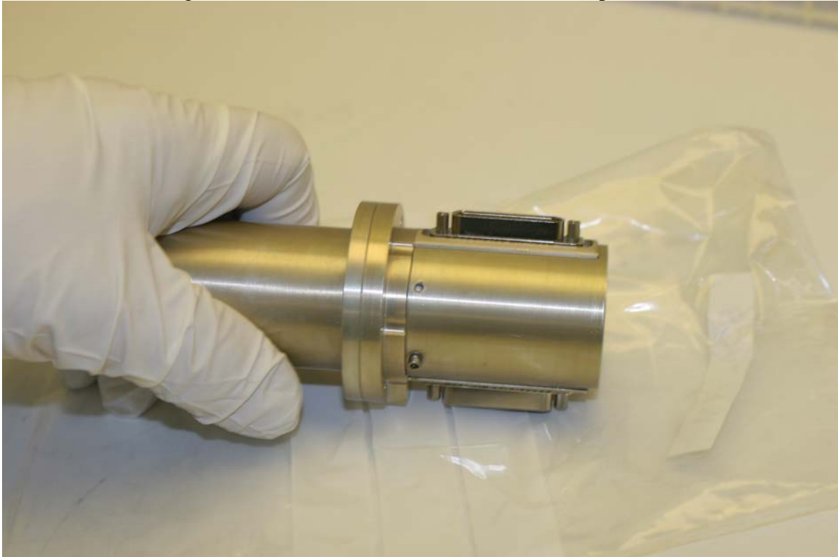
Photo 5 & 6 showing stud in Hole (as stated on External Visual Inspection sheet)