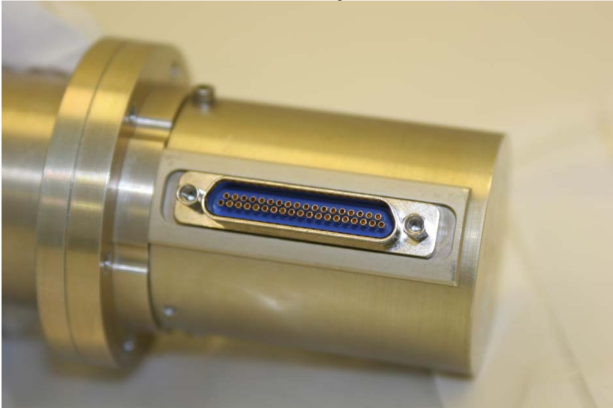
Photo 3 & 4 Prime & Redundant Connector Pin Alignment OK